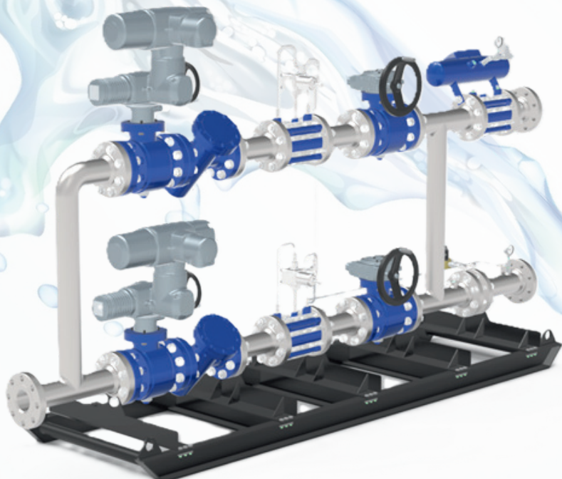
RGR™ Pressure Reducing Station