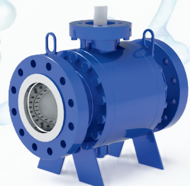
RGR™ Series B1 (Reliaball™) (Mining)