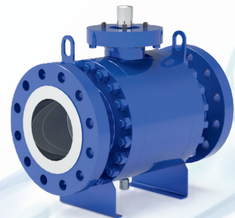
RGR™ Series PL (Oil and Gas)