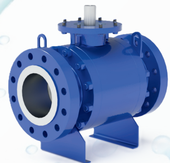
RGR™ Series MS (Slurry)