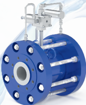
RGR™ Series PR (Flexible Sleeve Control Valve)