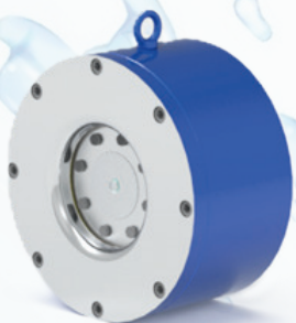
RGR™ Series C2 (Wafer Type Check)

RGR™ Technologies is a proudly South African valve manufacturing company delivering effective solutions for valve requirements in support of a variety of industries in Africa and beyond. Since 1991, we have cultivated an excellent reputation as a preferred valve manufacturer in South Africa, with specific reference to the oil and gas, petrochemical, mining and utilities, and paper and pulp industries.