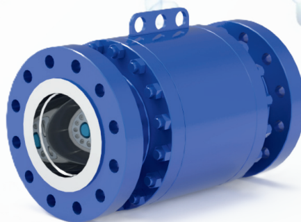
RGR™ Series C1 (High Pressure Service)