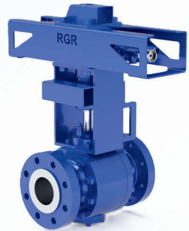
RGR™ Series PC (Petrochemical)

Our service includes the procurement of valves beyond our current manufacturing line, ensuring a single point of contact for all your project requirements.