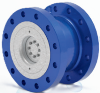
RGR™ Series C6W (Short Pattern Check)